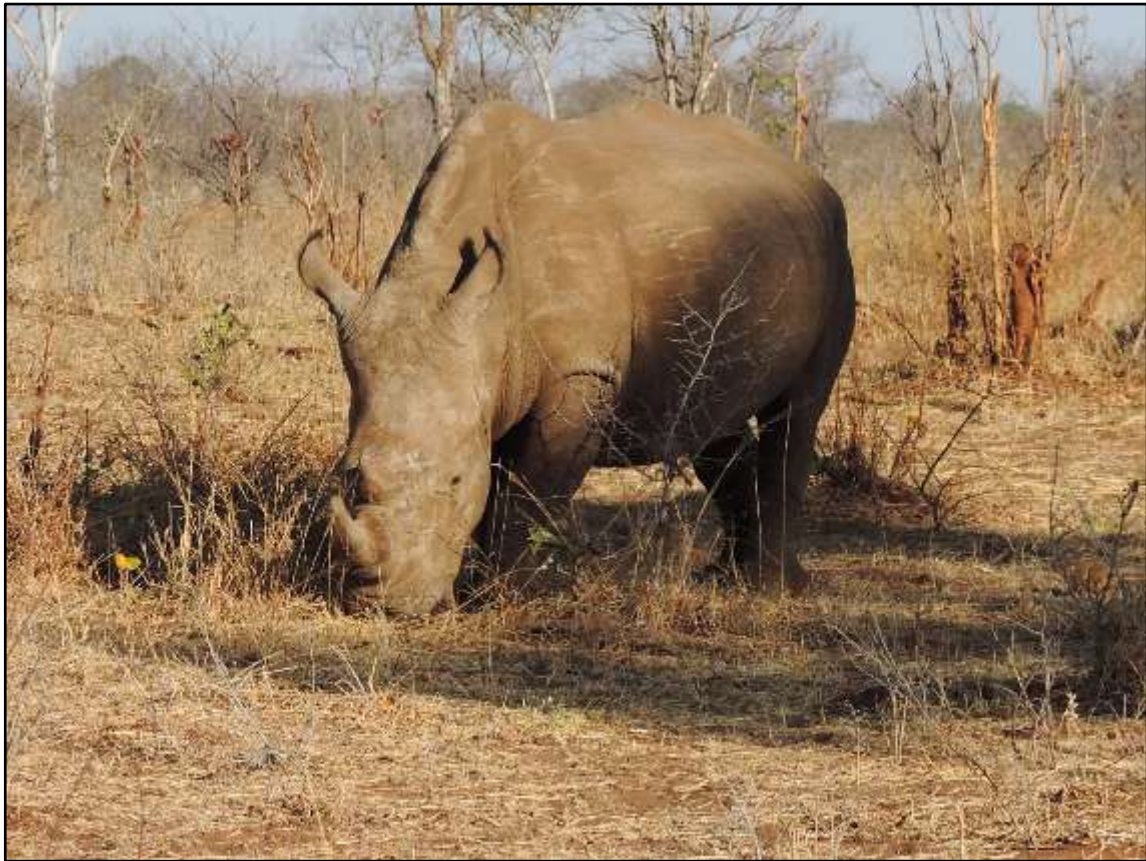
Square-lipped (or White) Rhinoceros