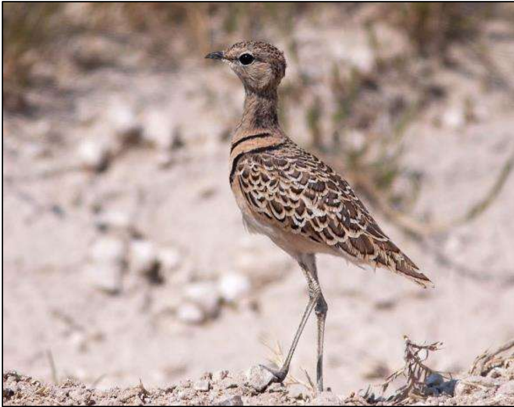
Double-banded Courser

NIGHT: Okaukuejo Camp, Etosha National Park