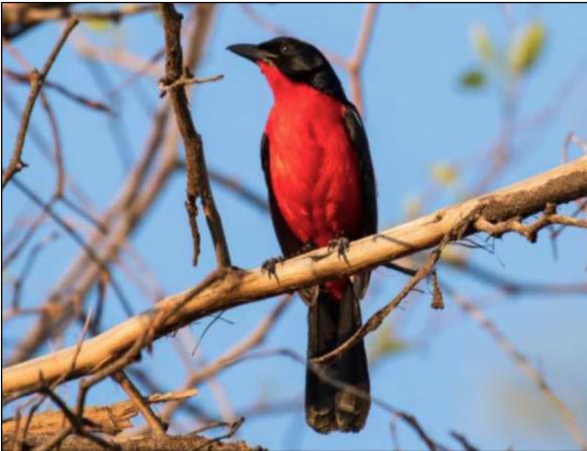
Crimson-breasted Gonolek

Namibia, Botswana, and Zambia—these little-known countries offer some of the greatest wildlife viewing on the African continent. They are huge in size and sparsely populated, with large areas little disturbed by man. We will divide our time between them, contrasting the arid hills and plains of Namibia with the lush swamps and woodland of Botswana's Okavango Delta region. We will focus on two major areas: Etosha National Park and the Okavango Delta. The tour ends in Livingstone, Zambia, affording participants the opportunity to see Victoria Falls, a roaring wall of water that is one of the great sights of Africa.