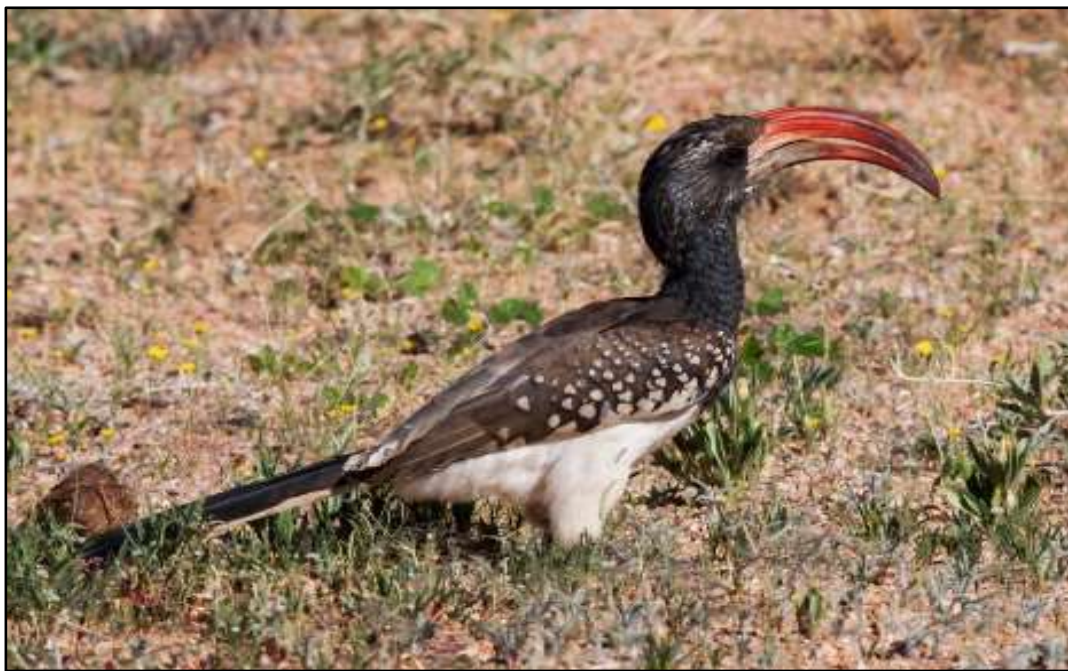
Monteiro's Hornbill

August 11-12, Days 1-2: Travel to Walvis Bay via Johannesburg. Participants will need to depart on overnight flights from various cities on August 11 and arrive in Johannesburg on August 12 in time to connect to a mid-morning commercial flight to Walvis Bay (flight details to be announced). Upon arrival and clearing customs, you'll be met by our local agent and transferred to Swakopmund to join the pre-tour group. The garden of our hotel offers Orange-River White-eye and White-backed Mousebird, both birds we won't see on the rest of the trip, while a short walk through the town to the coast offers the chance of seeing some of the coastal species like Crowned Cormorant, Hartlaub's and Kelp Gulls that we will also not see again on the rest of the tour.