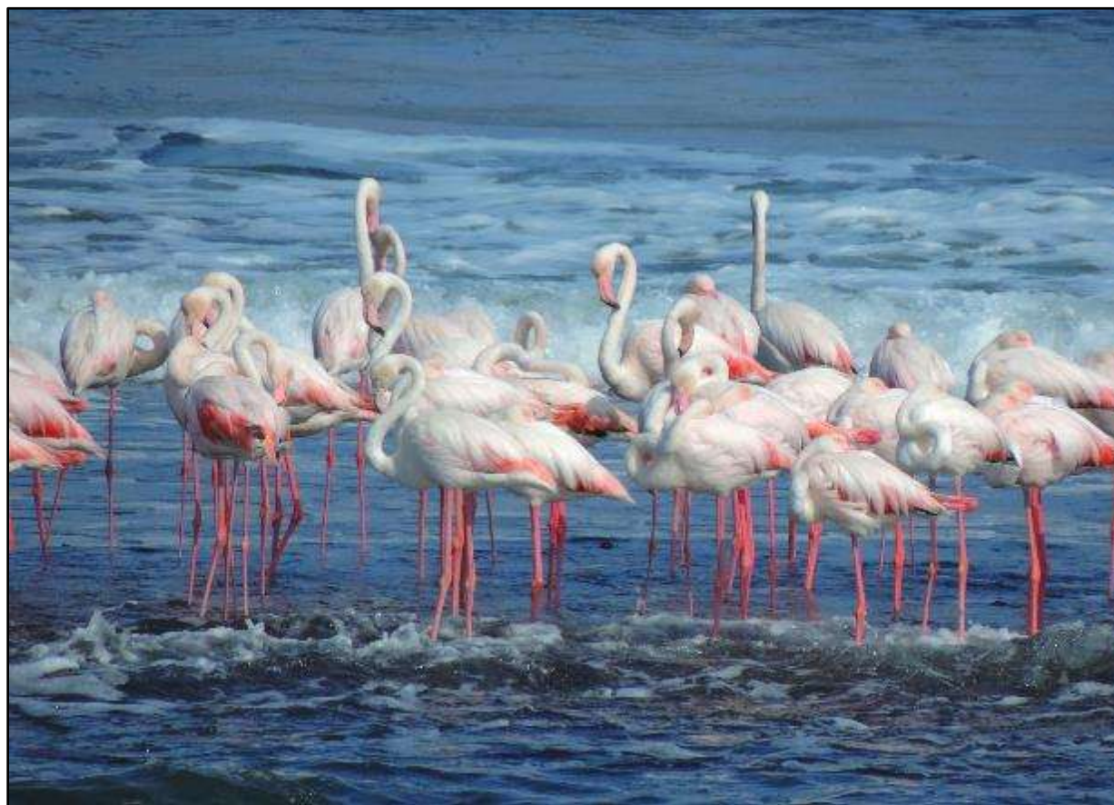
Greater Flamingos at Walvis Bay

August 10-11, Days 3-4: Swakopmund and Walvis Bay. We have two full days to bird the local area including Walvis Bay, the Kuiseb Delta, the two large salt works located on the coast, and the gravel plains north of Swakopmund. Our targets will include endemic and near endemics such as Cape, Crowned and Bank cormorants; African Oystercatcher; Hartlaub's Gull; South African Shelduck; and Damara Tern. Large tern roosts are often found in the area and we will search these for rarities such as Royal Tern amongst the more numerous Common, Arctic and Black terns. We can also expect numbers of Greater and Lesser flamingos and Great White Pelicans, as well as a host of shorebirds. Our trip coincides with the arrival of