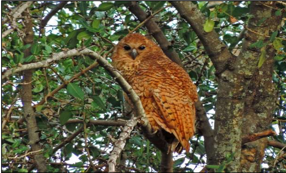
Pel's Fishing-Owl

Nxamaseri is located close to the Tsodilo Hills World Heritage Site—home to over 4,000 individual rock paintings dating back, in some cases, over three thousand years. Our lodge offers an optional half-day visit to this intriguing site and, depending on the level of interest in the group, individual participants or possibly the whole group may opt for this excursion. Note: In cases where only part of the group is interested in making this excursion, the leader will remain with the majority.