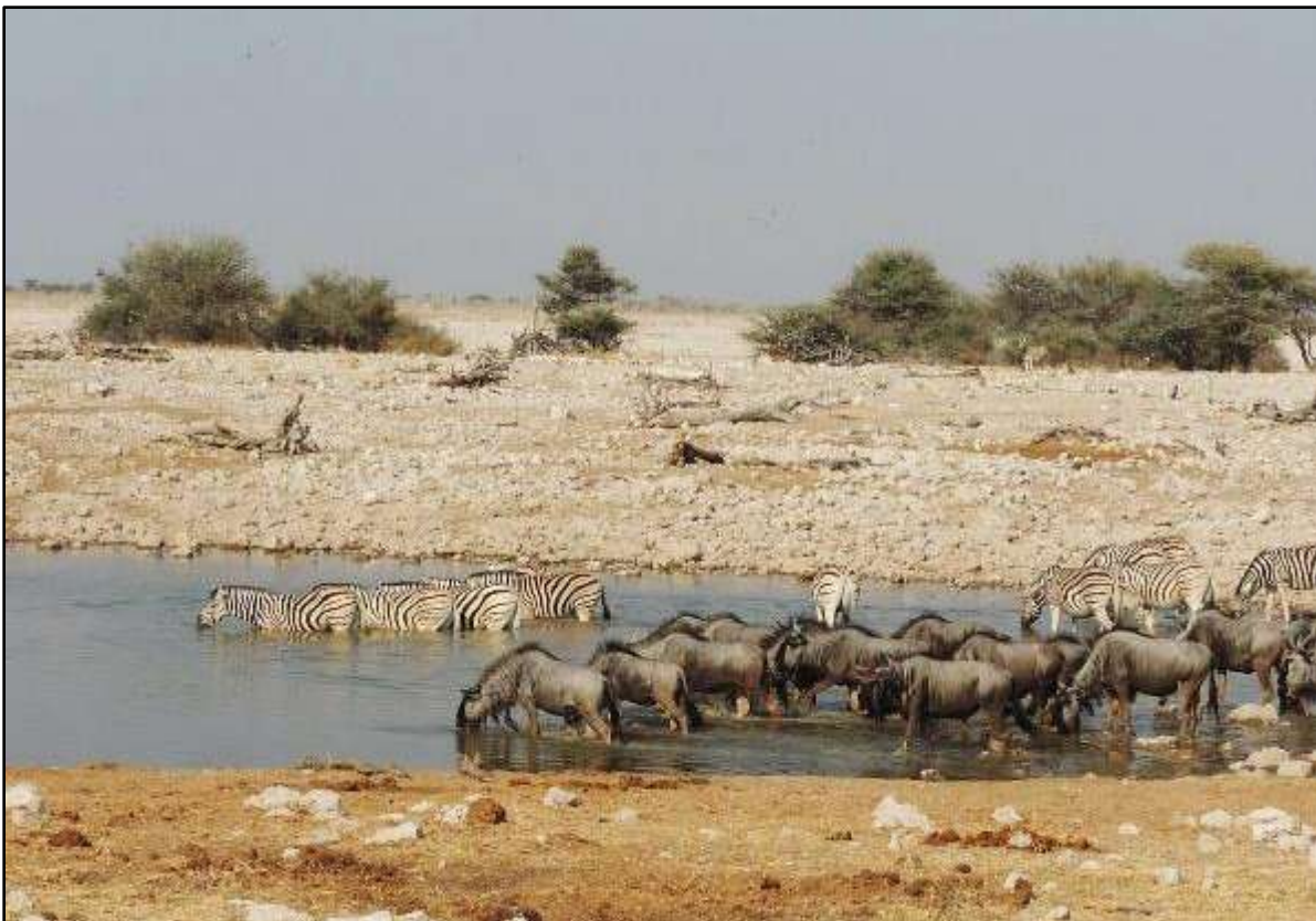
Common Zebra and Blue Wildebeest

August 15, Day 5: Okaukuejo Area; Western Side of Etosha National Park. We depart this morning on a long drive to the Okaukuejo area in the western portion of Etosha National Park, typically reaching the park in time for a late lunch. After settling in, we will bird around camp, spending time observing the procession of game and birds coming to drink at the waterhole next to camp. The scenes at the waterholes in Etosha are so incredible that they should not be seen hurriedly. Typically, we will spend the better part of each morning at one waterhole, returning to camp for lunch and a break before an afternoon game drive. The turnover of animals is phenomenal, as various species have a favorite time to drink. It may be like this scenario from a past tour: