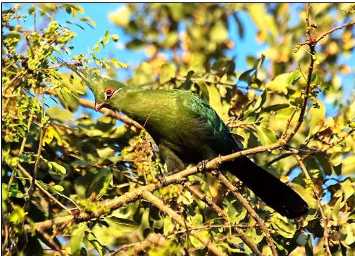
Schalow's Turaco